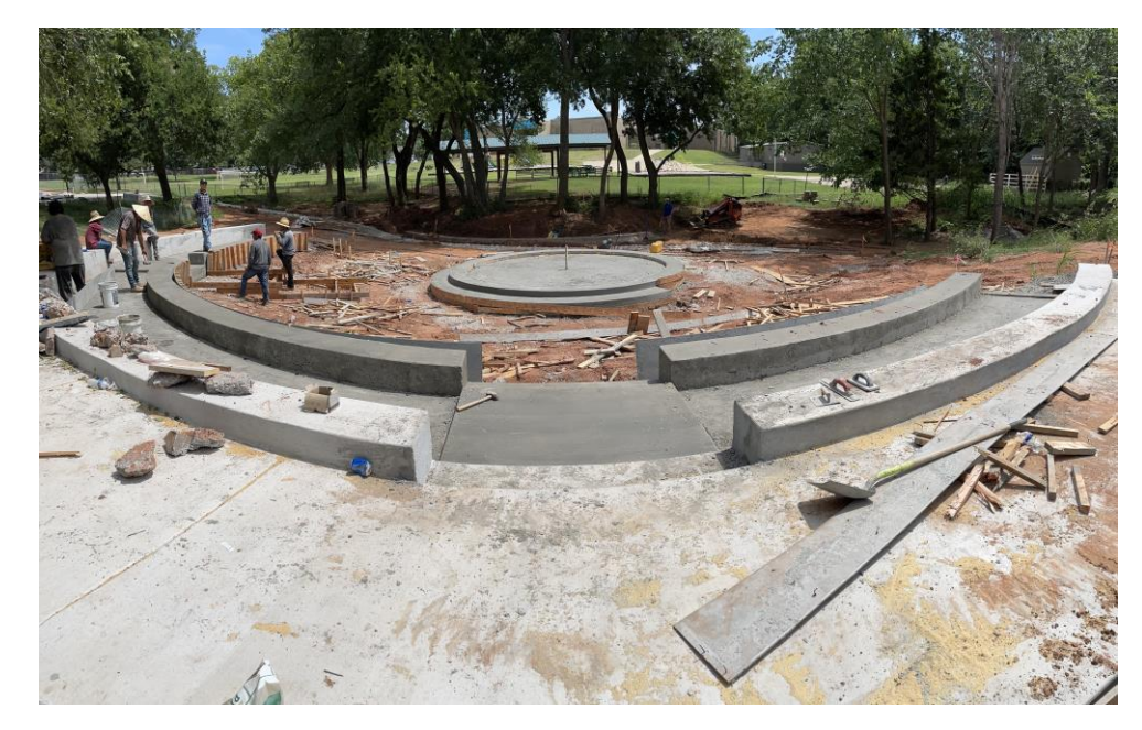
AMPHITHEATER SEATING AND PLATFORM