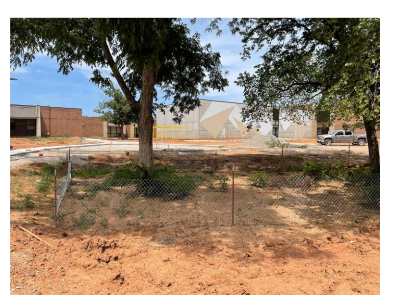
NINE SOUARE AND OUTDOOR RECREATIONAL AREA