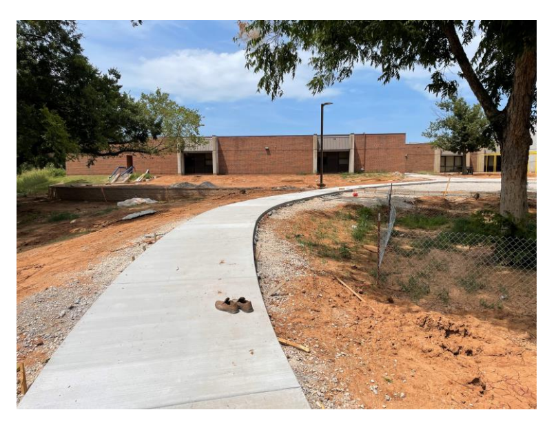
RETAINING WALL AT NEW PLAY AREA